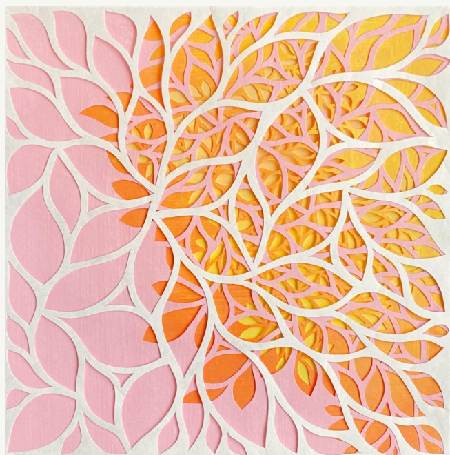
Silvastrata #1, 8"x8", acrylic on hand-cut Tyvek, 2022

Also integral to my practice is my role as mother and primary caregiver. As an artist mother, my creative process is both a respite from the challenges of motherhood and a celebration of the new eyes I've gained through the lens of my children. As child-scientists, my children use experimentation and play to navigate the world around them and approach their natural environment with intense awe and curiosity. I try to apply this same approach to art-making despite my precision and perfectionist tendencies. Each work is an experiment in materials and processes and an attempt to dissect and better understand the world around me.