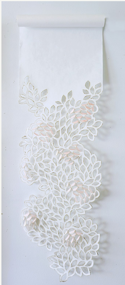
Shadowscape #11, 11" x 35", colored pencil on hand-burned kozo, 2021