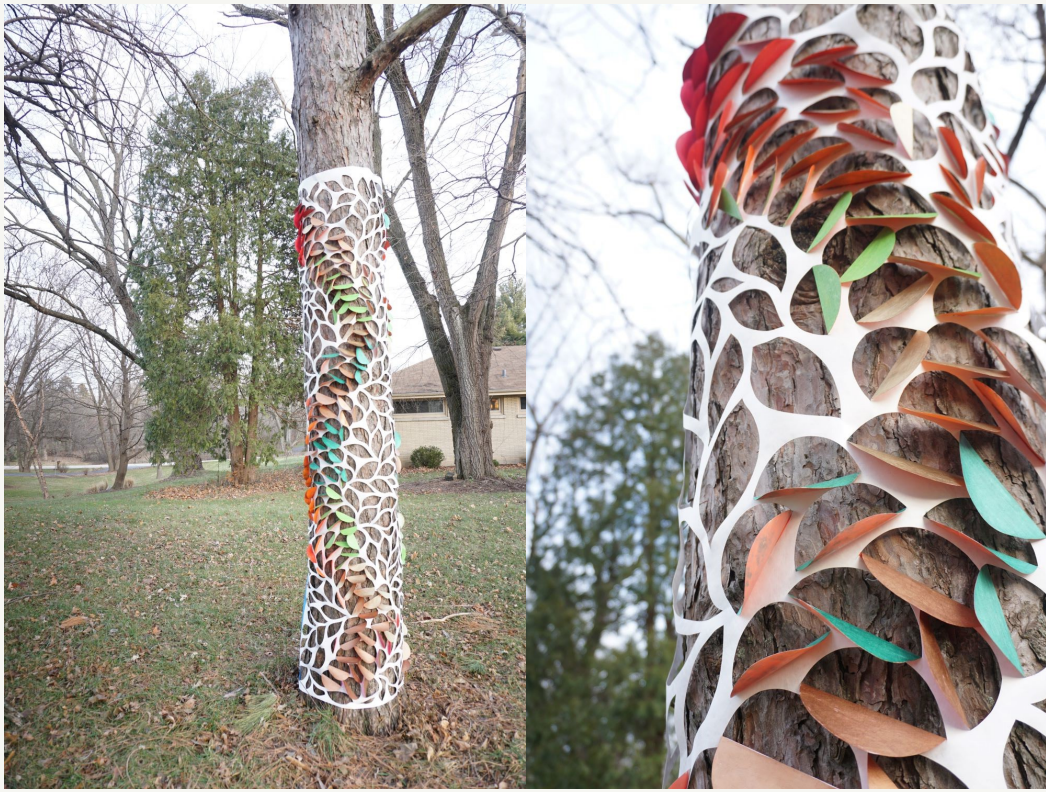
Tree Totem, installation in St. Charles, IL, 2021