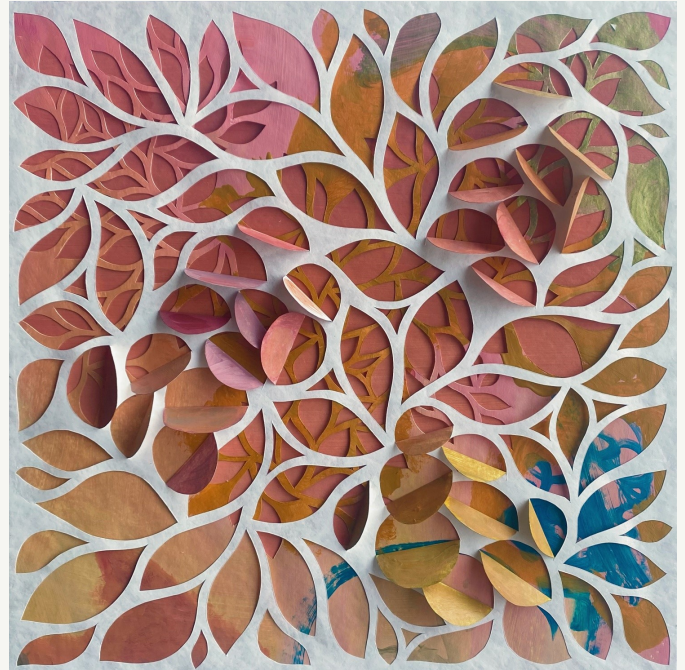
Chasing Robins, 12" x 12", acrylic on hand-cut Tyvek mounted on birch panel