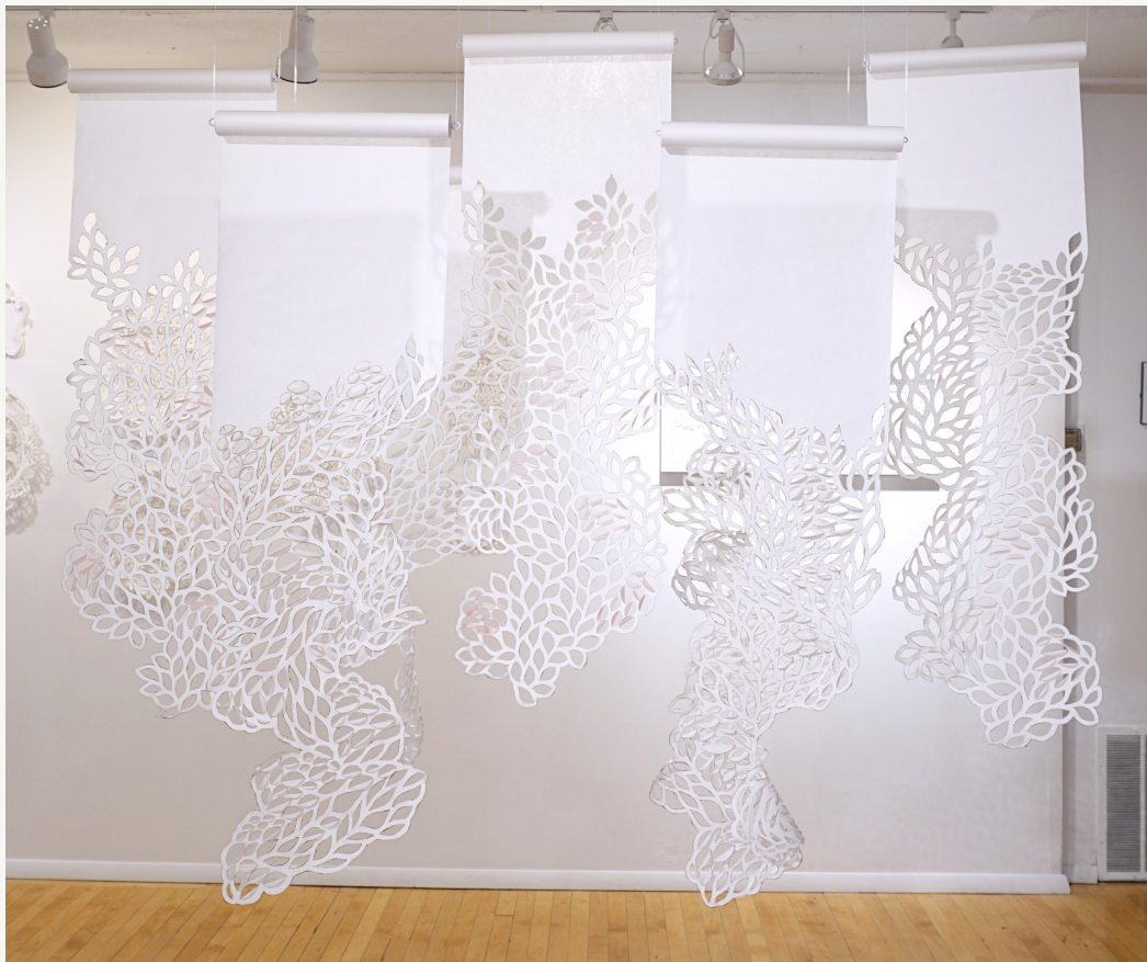
Shadowscape series, installed as part of "Going Dutch" at Side Street Studio Arts in Elgin, IL, 2021