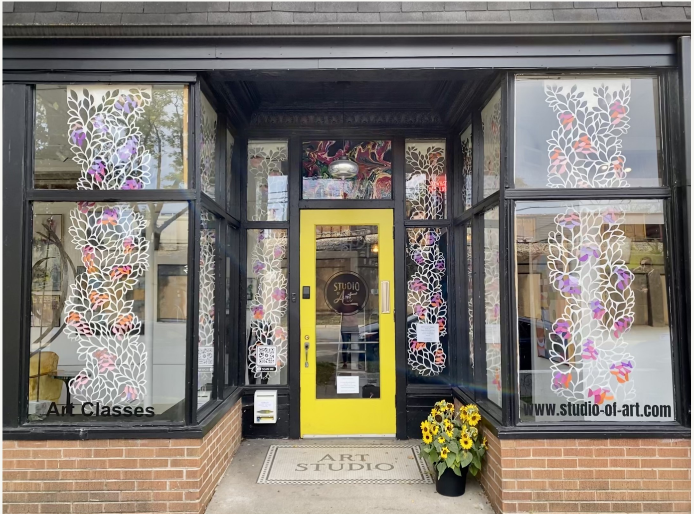
Shadowscape (Home), installed as part of the 2021 Terrain Biennial at Studio of Art, Oak Park, IL