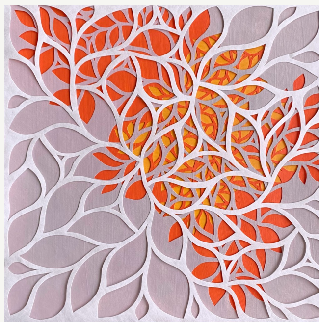
Silvastrata #2, 8"x8", acrylic on hand-cut Tyvek, 2022