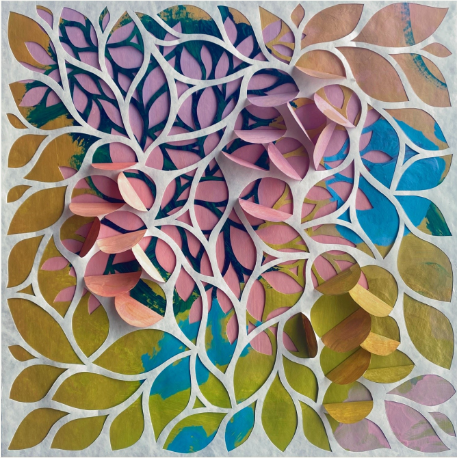
Climbing Magnolias, 12" x 12", acrylic on hand-cut Tyvek mounted on birch panel