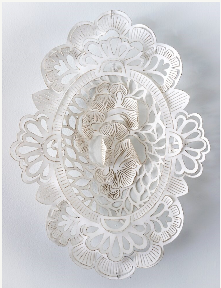
Nature Enshrined #1, 13" x 17", hand-burned kozo, 2021